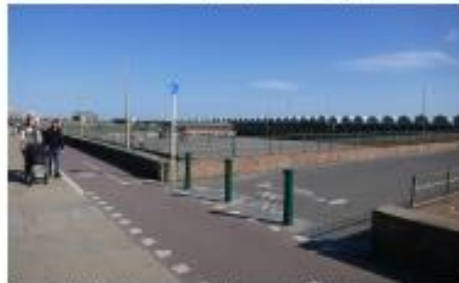
Accessible public realm spaces at Park stations (MUGA and Tennis)