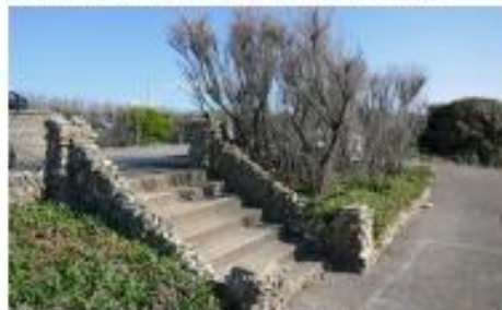
Accessible gardens (Sturges Garden beside Rockover)