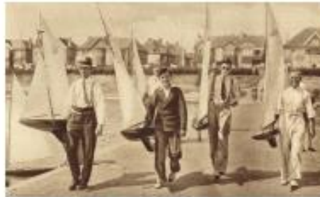
Hove model yachts club - heritage of watersports and related activities

Before Hove's urban expansion, most of the site area was part of the natural shingle beach, which was reclaimed to create a series of recreational spaces during the late 19th and early 20th, including the Lagoon, Bowling Greens, and other amenities, as part of the Western Lawns. The character of these spaces is defined as large landscape 'rooms' by the north-south access routes that connect Kingsway to the Esplanade. The wall along the Esplanade's rear is 'locally listed' and the project site's east end includes the southern part of two Conservation Areas. West Hove Seafront is in the liminal zone between land and sea, affected by the local climate, including salt-laden winds. Providing adequate shade and shelter for comfortable use of the Western Lawns' facilities has always been a particular requirement and challenge on the site.