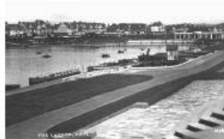
Hove Lagoon, 1830s