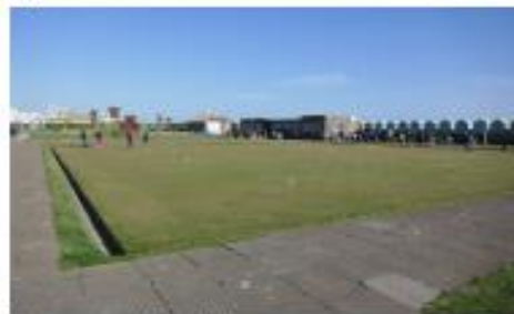
Existing sports areas (Craque lawn)