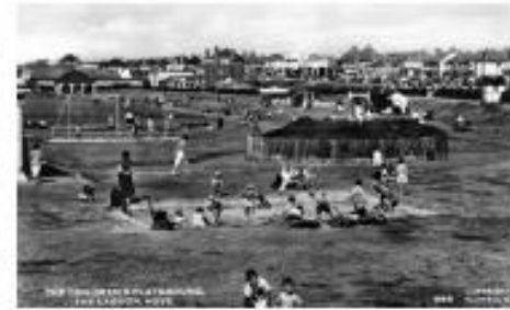
A developed site has always been a public landscape for health and wellbeing