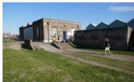
Historic buildings and 'locally listed' structures in the Conservation Areas